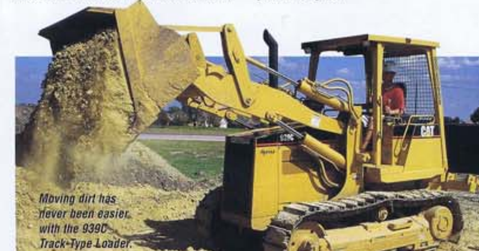
Moving dirt has never been easier with the 939C Track-Type Loader.

"I think the Cat name is a big part of it. I never realized that the name would make such a big difference – but it does."