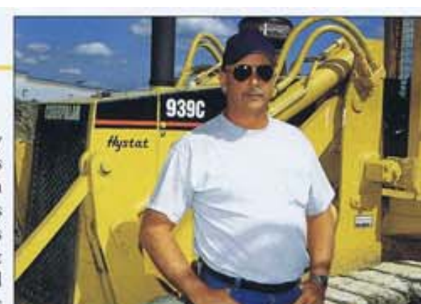
"I never realized that the Cat name would make such a big difference – but it does." —Bill Miller

Miller and Miller has built a solid reputation, too, with high tech "completely stakeless" grading for site preparations using Global Positioning Systems (GPS),