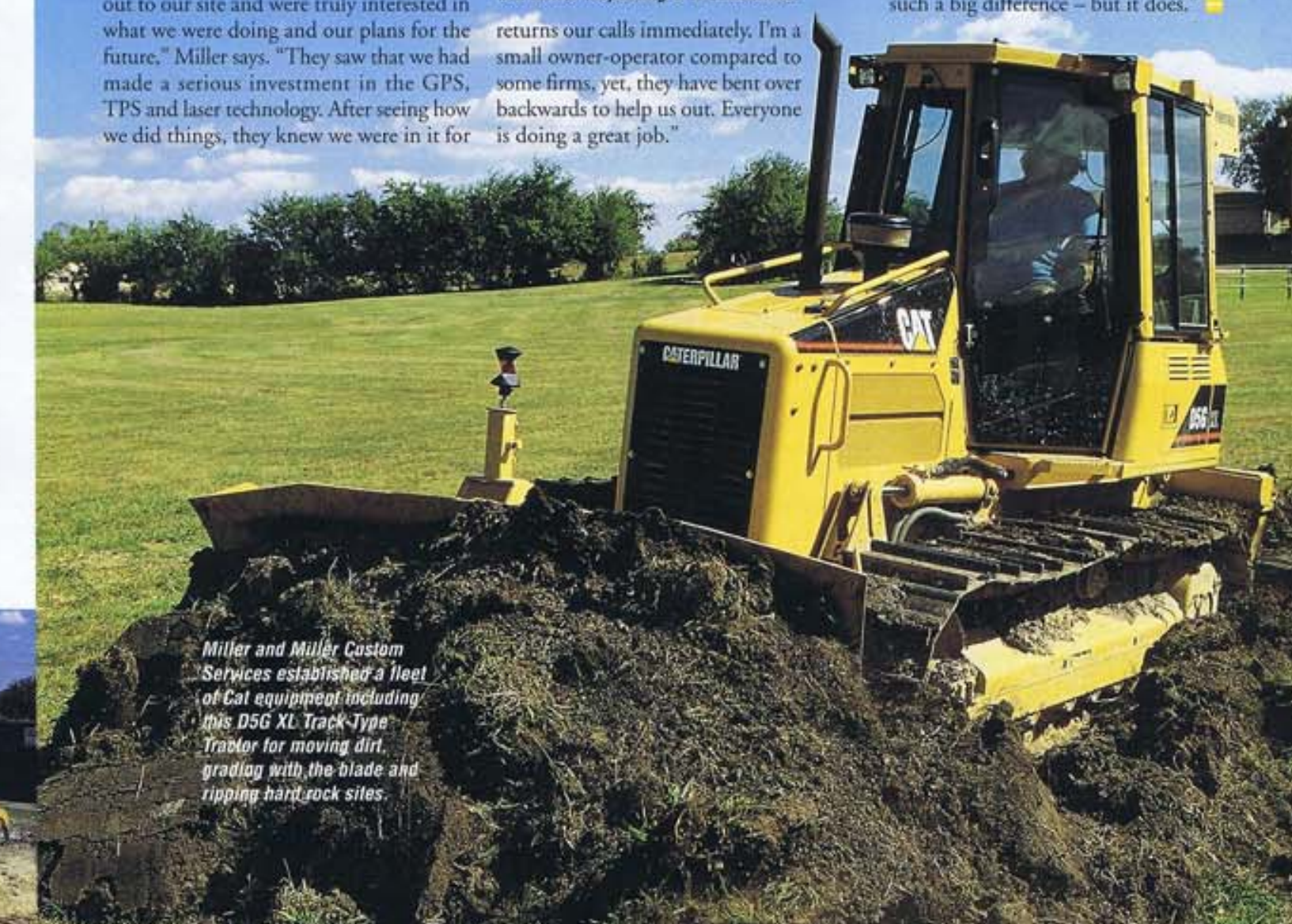
Miller and Miller Custom Services established a fleet of Cat equipment including this D5G XL Track-Type Tractor for moving dirt, grading with the blade and ripping hard rock sites.

returns our calls immediately. I'm a small owner-operator compared to some firms, yet, they have bent over backwards to help us out. Everyone is doing a great job."